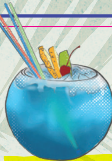
MAUI WOWIE FISHBOWL