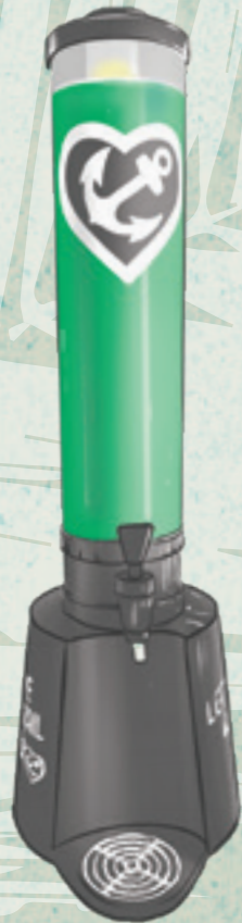
TOWER OF TERROR

A credit card must be left at the bar until the cocktail vessel is returned. You will be charged for damaged or missing property.