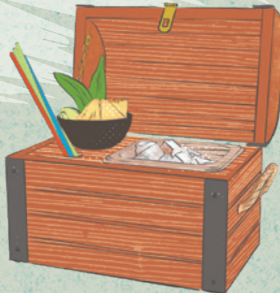
ALL HANDS ON DECK