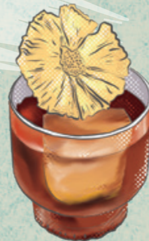
PINA COLADA OLD FASHIONED