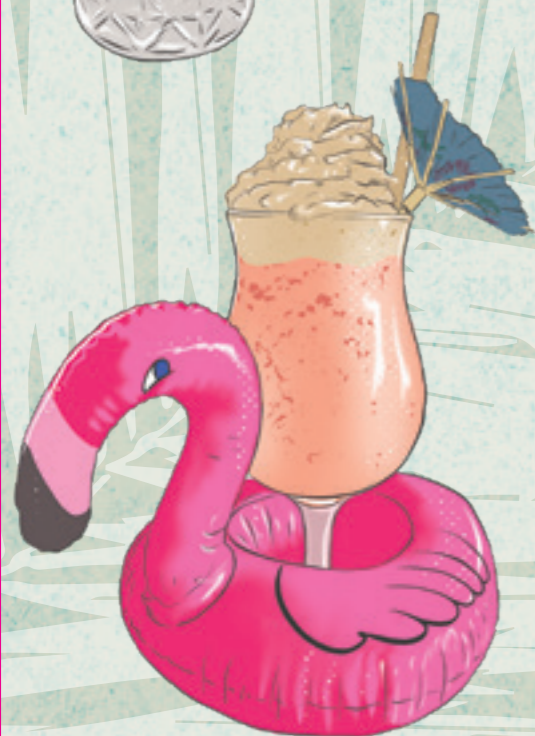
FLAMINGO POOL PARTY